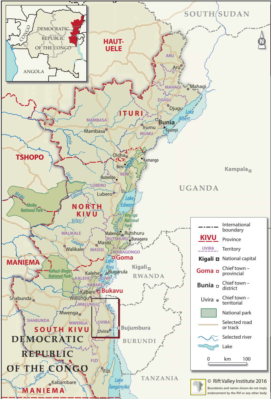
Map 1. The eastern DRC, showing area of detailed map on the following page